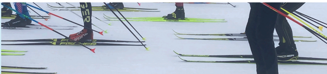
A fast start in the 10km Birkie Classic