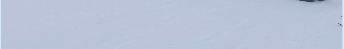
A foggy start to the Birkie Ski Classic