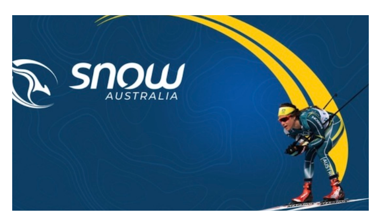
Snow Australia Cross Country Update May 2022