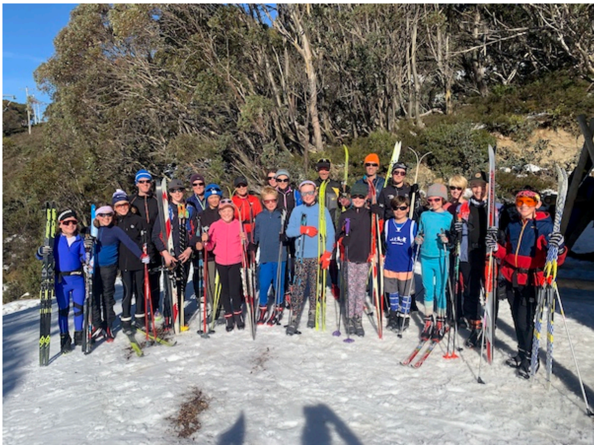
Birkie juniors and instructors – the club has been conducting this weekend since the early 1990s