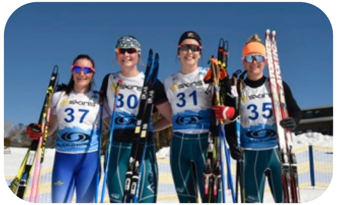
Women's Sprint Finalists

A few BNSC members really got into the Hoppet spirit this weekend....Do you know who they are?