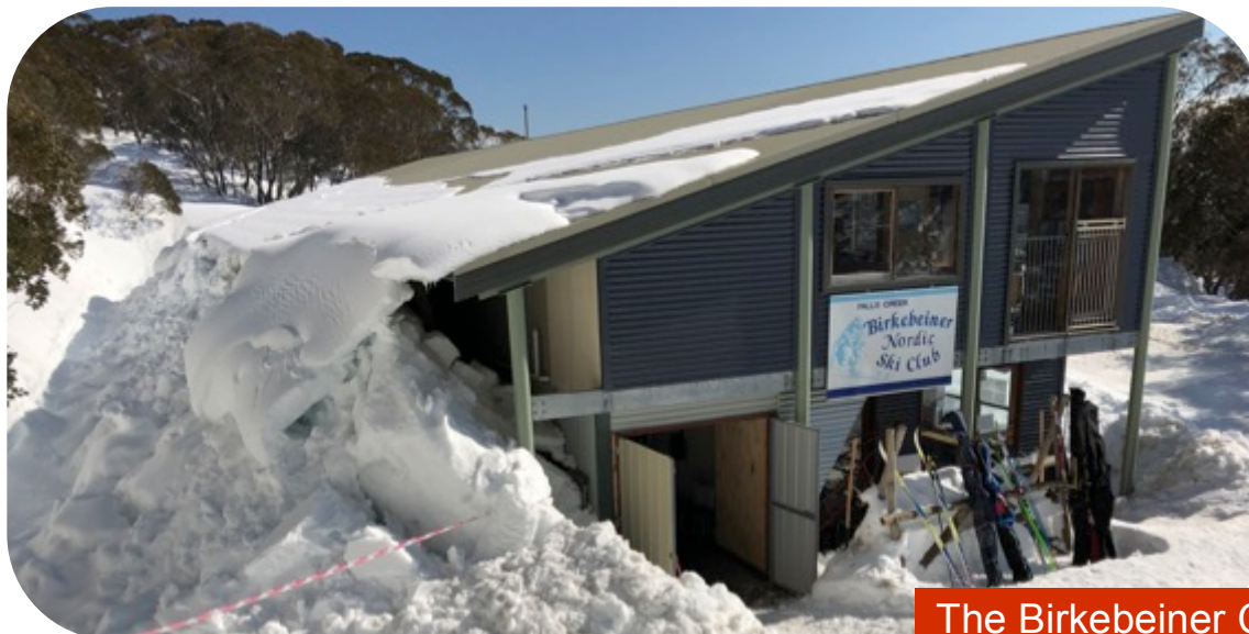
The Birkebeiner Clubhouse