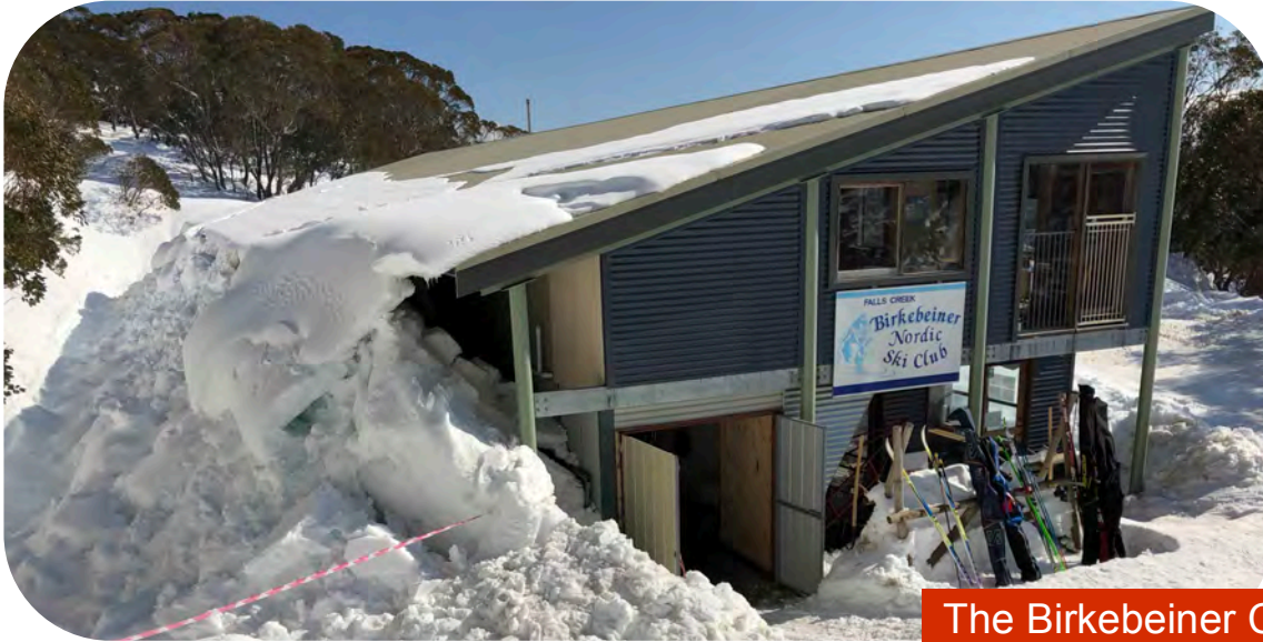
The Birkebeiner Clubhouse