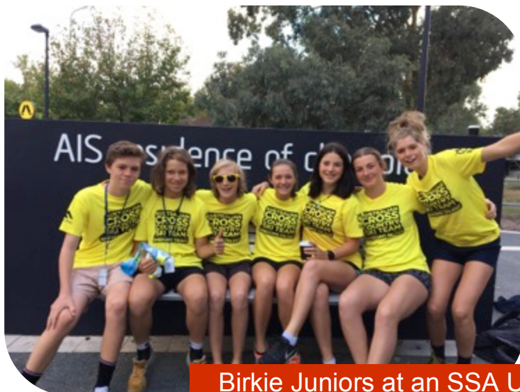
Birkie Juniors at an SSA U16 Development Camp at the AIS