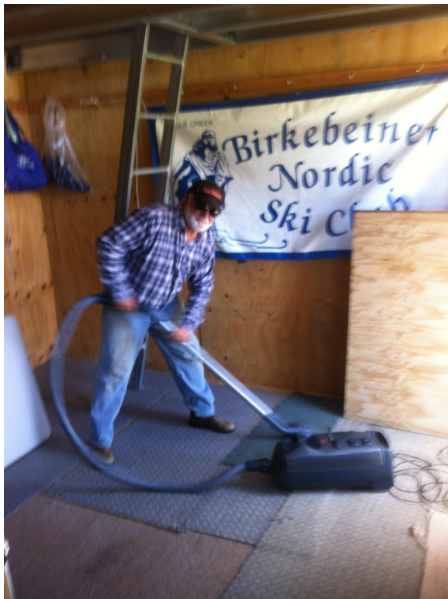
Keebs, man of many talents.