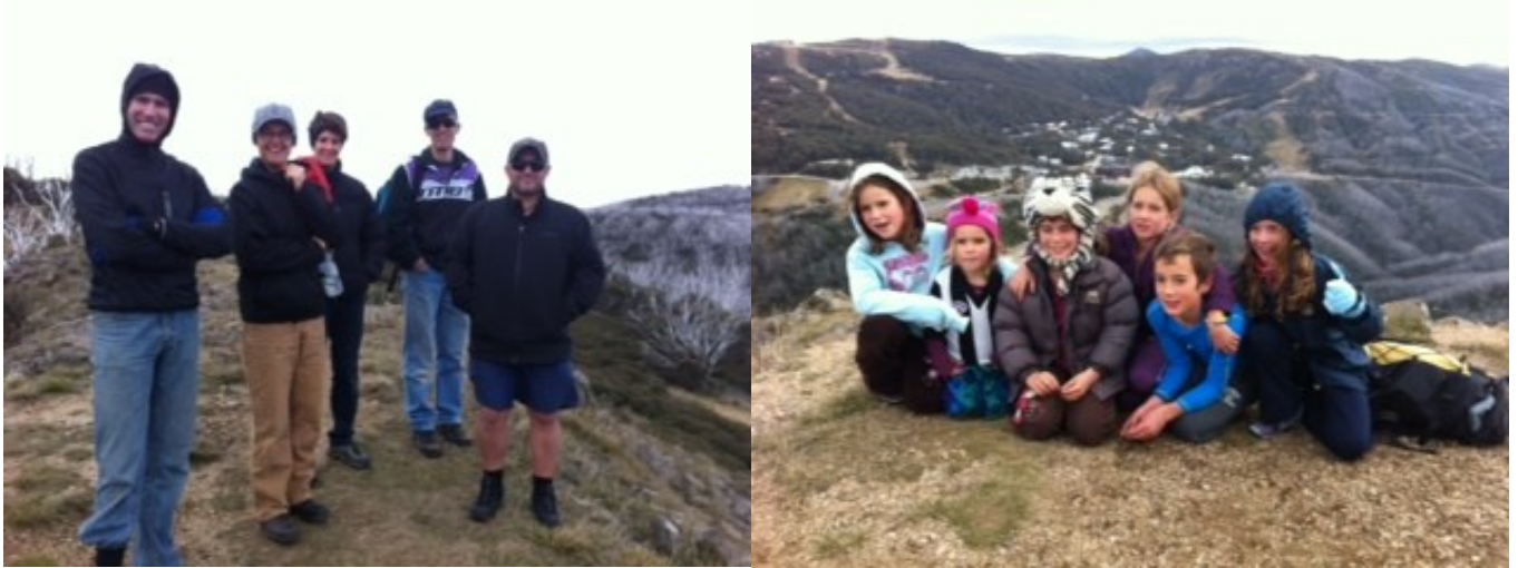
Photos taken after Birkie clubhouse working bee at Ropers Lookout