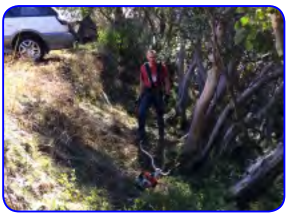
Blair Hume (access track construction)