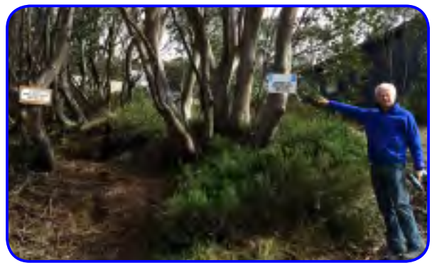
Doug Hamilton (start of access track)