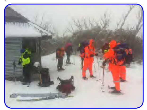
Michelle Hut (1,620m) - Eskdale Spur Mt Bogong

BSAR members participated in the rescue of an injured skier on Mt Bogong on 12 August 2015 in overcast weather and snow showers following a local call-out by Mt Beauty Police. The rescue involved a stretcher haul from Tadgell Point then down Eskdale Spur to Michelle Hut under the supervision of Police SAR.