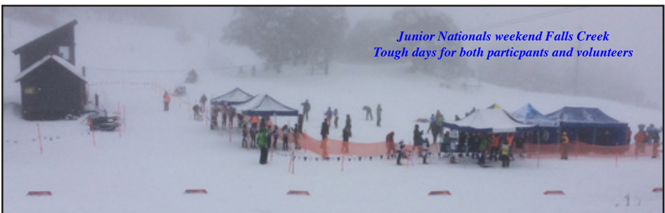
Junior Nationals weekend Falls Creek Tough days for both participants and volunteers

Ode to the big Kangaroo Hoppet, a ski race turning twenty-five, the race that for the rest of the year in preparation will keep us alive.