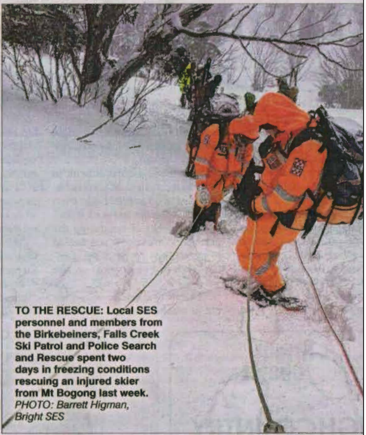
TO THE RESCUE: Local SES personnel and members from the Birkebeiners, Falls Creek Ski Patrol and Police Search and Rescue spent two days in freezing conditions rescuing an injured skier from Mt Bogong last week.

"They are invaluable in what they do and they're usually the first to respond and get to the person and stabilise them before anyone else gets there."