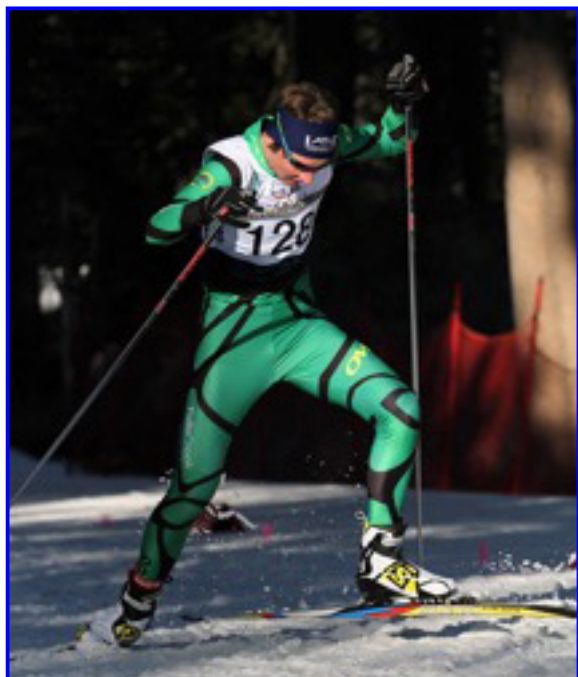
Junior Nationals Skate Sprint Qualification