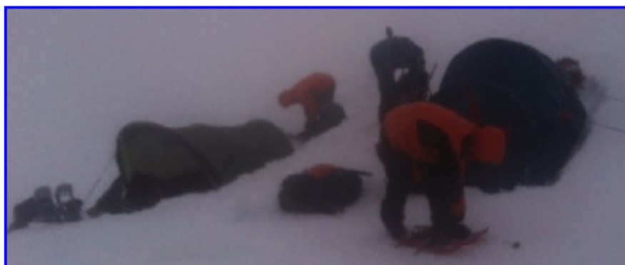
Campsite, Staircase Spur.