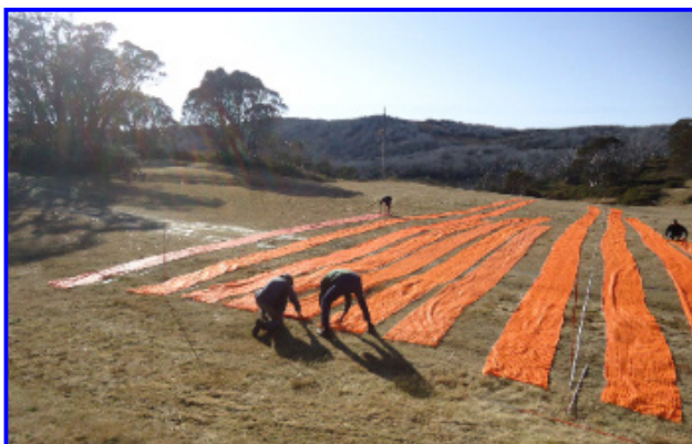
Workers measuring sections of fencing, cutting to size, labelling and storing in the Horseyard Hut ready for Hoppet setup day.