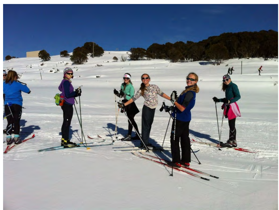
Junior Birkies having fun.